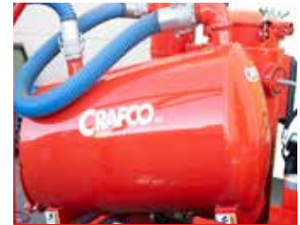
100 Gal Debris Holding Tank w/ Hydraulic Dump