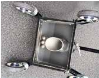
EZ-Glide Wand & 4-Caster Head