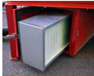
HEPA Filter (exceeds OSHA standards)