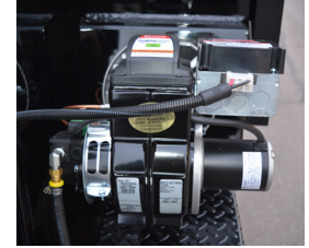
Fuel-efficient and easy-accessible burner