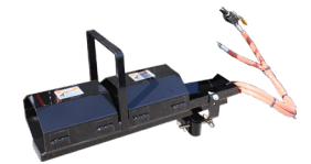
Optional heated swivel chute