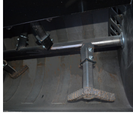
Angled agitation blades to blend and sustain aggregate suspension