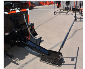
Optional drag box

A large burner, extensive heating surface area and precision thermostatic controls allow more heat to get into the material. Depending on the specific mastic, the Patcher II can melt 1,500 lbs (680 kg) per hour. That 200 gal (757 l) of mastic sealant will achieve 380°F (193°C) temperature and be ready to pour in 2 hours 1 . The Patcher II is the fastest mastic sealant melter available!