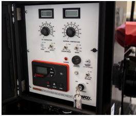
Digital controls for temperature accuracy