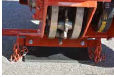
Carbide-Tipped Rotary Cutters