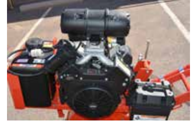
Dual-Stage Air Filter