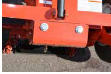
Carbide Skid Plate