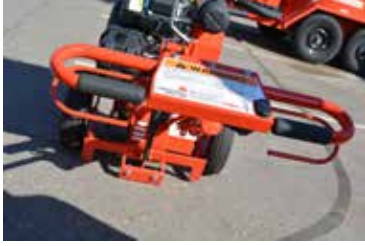
Ergonomic Handle Design

All Crafcro routers come with 17 standard features that are options on competitor models, making for a cost-effective choice. Top features include: