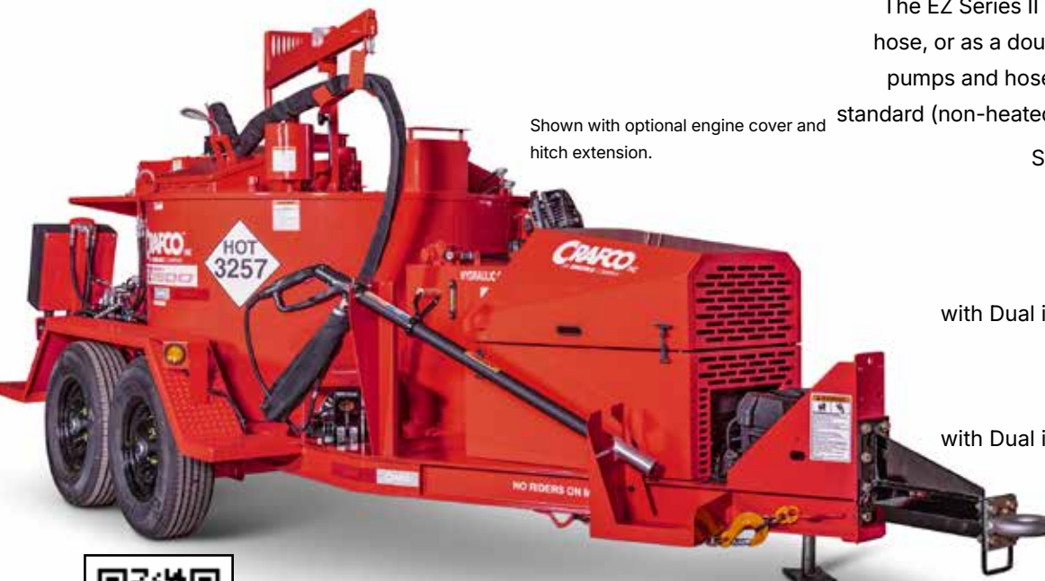
Shown with optional engine cover and hitch extension.

Double Pumper Electric Base with Dual independent Pumps and Controls (electric hoses)