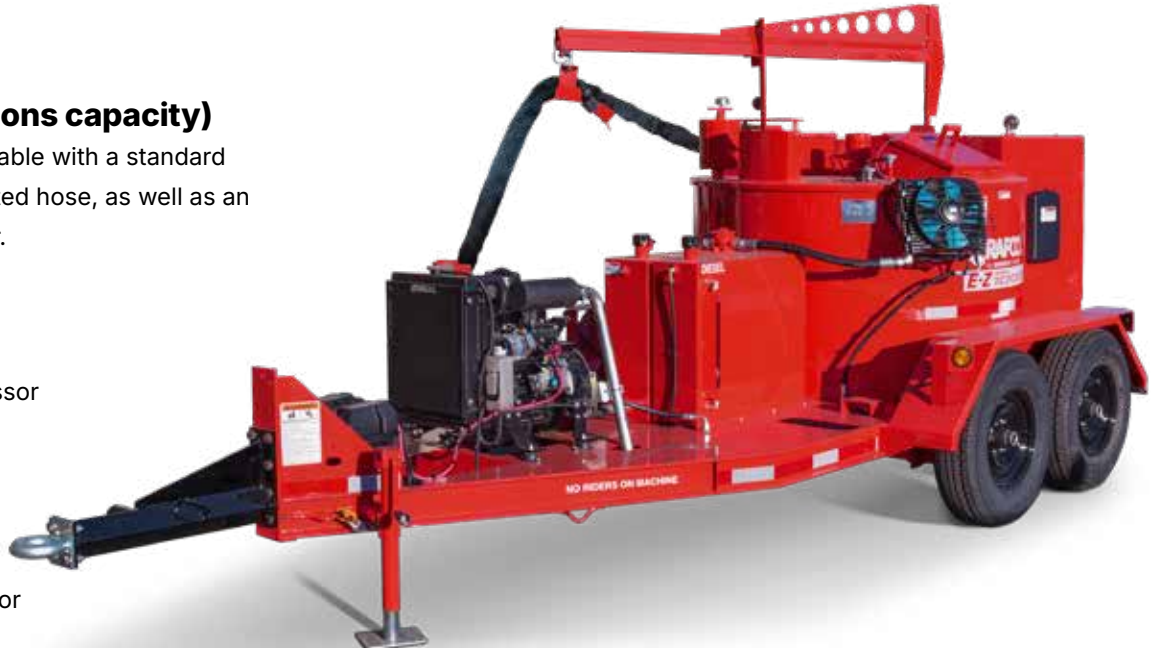
Shown with optional hitch extension..

Electric Base with Compressor (electric hose)