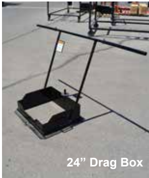
24" Drag Box