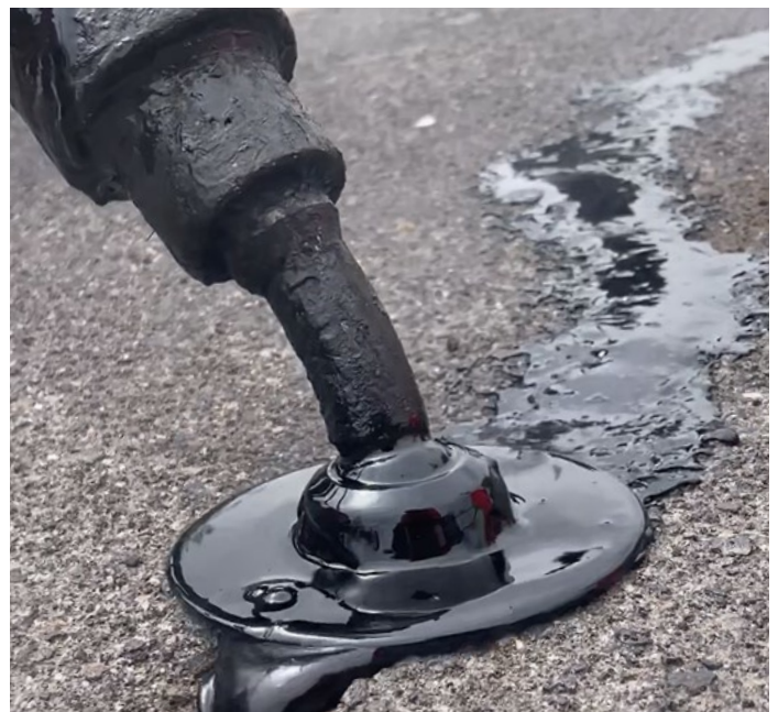
Without proper sealing, cracks turn into potholes.

Each street—most of which are asphalt—is assessed every three years using a specialized vehicle equipped with imaging technology and sensors that look for problems such as cracks and potholes. That information is used to assign a pavement quality index (PQI) score for each street in the city’s 1,241-lane-mile network, which equates to 532 centerline miles. Those scores are fed into Stantec’s RoadMatrix software to create deterioration curves for each segment, enabling Bond’s team to identify the ones that are good candidates for pavement preservation.